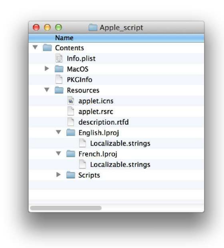
Figure 7-1 Bundle structure with localized string data

2. Create lproj folders in the Resources directory of the bundle for each localization: for example, English.lproj, French.lproj. Create files named Localized.strings in each one. When you are done, the folder structure should look like this: